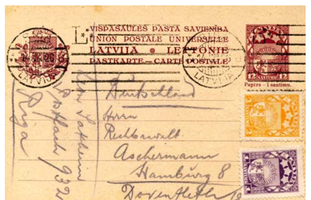
Fig. 20 1926 Latvia very rare Postal Stationery - Maximum Card