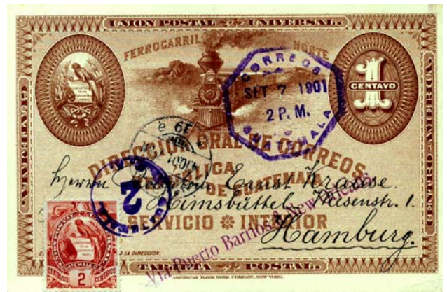
Fig. 17 - 1901 Guatemala Postal Stationery - Maximum Card