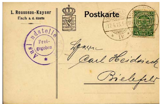
Fig. 19 1915 Luxembourg very rare Postal Stationery-Maximum Card