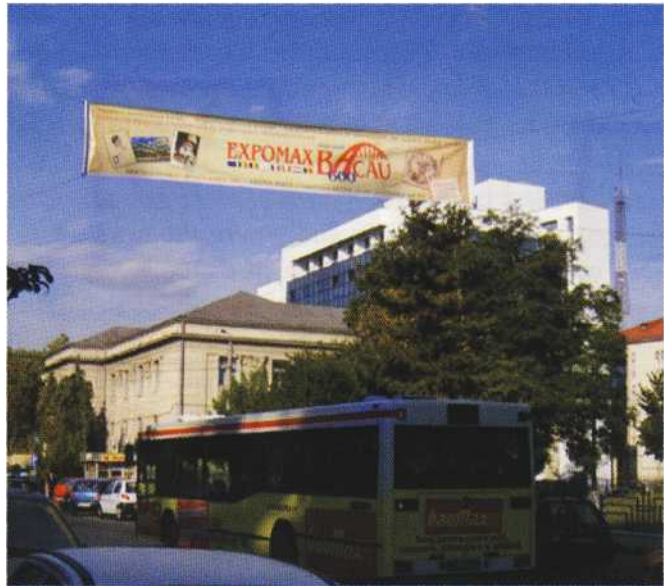
Fig. 2 - The great deal of promotion in the main crossroads of the city