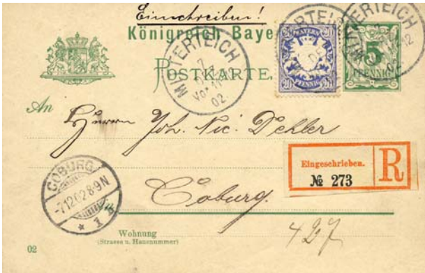
Fig. 11 - 1902 Bayern Postal Stationery Maximum card. The image of the Coat of Arms is almost the same on the postcard compared to that on the stamp. The F.I.P. 2006 Maximaphily regulations revised in Malaga, state that old postal cards with small size illustrations are accepted due to their early date and rarity.

This is certain postal stationery, on which the image of the stamp stuck on the view side of the postcard has a visible concordance with the very small picture printed on the postcard. We all agreed that these postcards, in conformity with the regulations, both previous and new, are considered precursors of Maximaphily and in consequence these postcards are valid maximum cards.