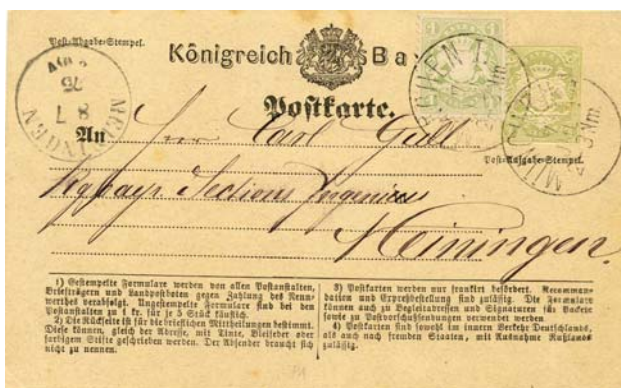
Fig. 14 - 1875 Bayern rare upgraded Postal Stationery - Maximum card