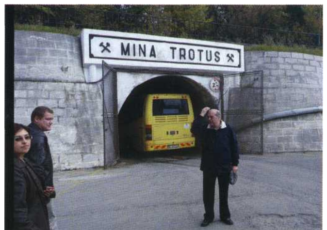
Fig. 7 - The bus while disappears entering the mine