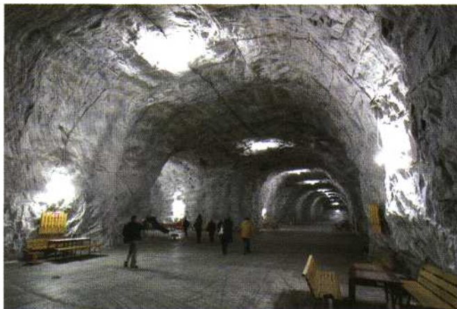
Fig. 8 - The 11th level at a depth of 240 metres below the surface

It takes twenty minutes by bus to descend to the 11 th level at a depth of 240 metres below the surface. The colour and characteristic smell of solid salt, the feeling that we are far from the sun and oxygen and the cold we felt because of the temperature down there, made us anxious but at the same time the mine offers to thousands of others treatment for their chronic respiratory ailments, (fig. 8) For the first time in our lives we found