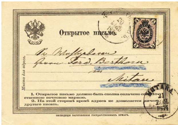
Fig. 13 - 1874, Wonderful Russian Postal Stationery - Maximum card. The image of the Coat of Arms on the postcard is slightly bigger compared to that on the stamp. One of the oldest known Maximum Card with excellent visual concordance