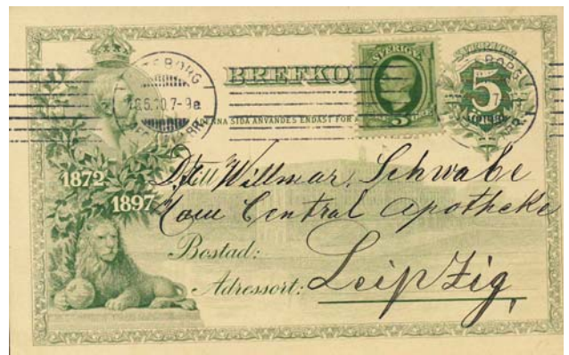
Fig. 18 - 1910 Sweden Postal Stationery - Maximum card