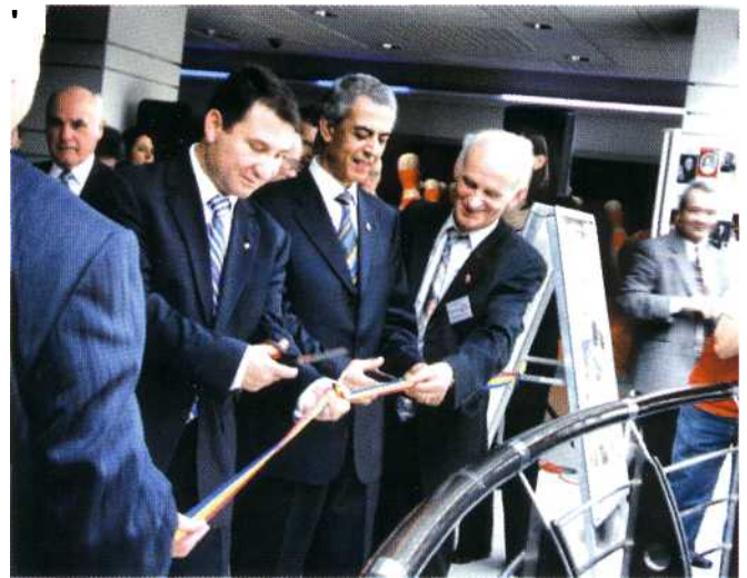
Fig. 6 - The opening ceremony

Another innovation was introduced with the organisation of a guided tour of two days. It started with Bacau, the birthplace of the Olympic champion Doina Melinte, the great poets George Bacovia and Vasile Alecsandri and of numerous distinguished painters, celebrated writers, mathematicians and other men of science. The "Mihail Jora" High School, the "G. Bacovia" Theatre and