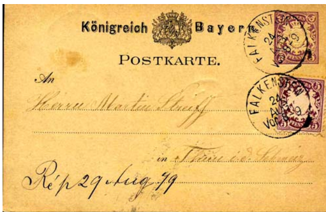
Fig. 15 - 1879 Bayern upgraded rare Postal Stationery - Maximum card