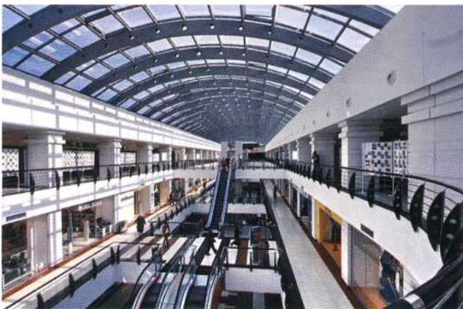
Fig. 5 -The modern Mall of Bacau where the exhibition was hosted

The second innovation was the choice of venue for the exhibition. In addition to the town Museum, which hosted a dozen of the collections, the large, modern, commercial complex of Bacau the "Arena Mall", was chosen (fig.5). The frames with the collections on display covered almost all the spaces of the wide passages of the second floor.