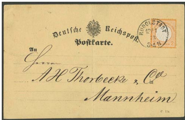
Fig. 12 – Very interesting 1873 German Postal Stationery. One of the oldest known Maximum Cards with excellent visual concordance