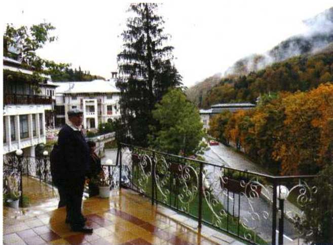
Fig. 10 - Vasile Doros in front of his wonderful villa on the mountain in Slanic

Our final stop was at the mountain resort of Slanic-Moldova where we had the opportunity of living for a short time in the well-built holiday villas and admiring the river falls and the wonderful scenery with the many natural beauties of the green mountain and autumn colours, (fig. 10)