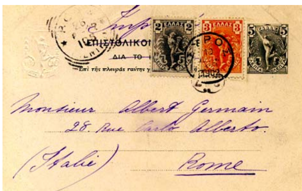
Fig. 16 - 1901 Greece, the Hermes image embossed on the postcard is exactly the same to that on the stamps - Only one known